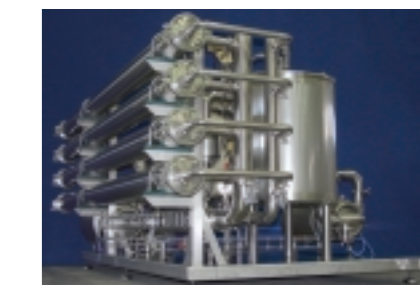
A correctly designed system employs equipment from all of Alfa Laval's key product areas – fluids handling, separation and heat transfer.