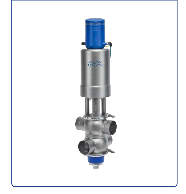
Figure 1. Alfa Laval Unique Mixproof valve with the ThinkTop V70 control unit.

consumption during production. Cleaning process equipment, such as mixproof valves, can contribute significantly to reduced water use. Alfa Laval can help manufacturers realize substantial water savings – without compromising product hygiene or safety – by using Alfa Laval Unique Mixproof CP-3 valves with innovative ThinkTop control tops.